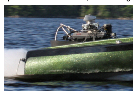
Exposed Inboard or Inboard/Outdrive Engines